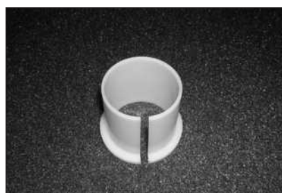
ME-4200 Nylon Bushing - 2 each