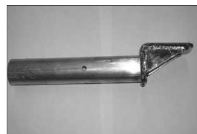
E-2040 Flex Mount Post