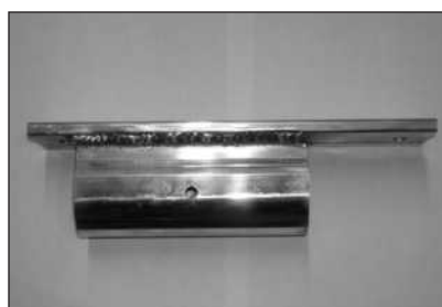
E-2035 Aluminum Base